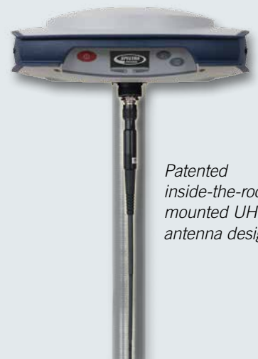
Patented inside-the-rod mounted UHF antenna design