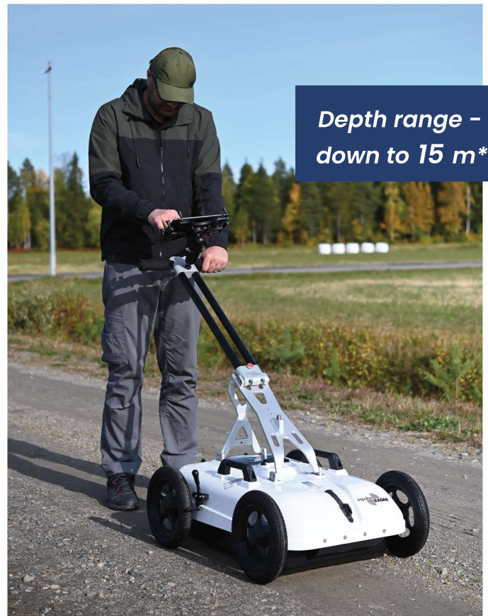
*Figures for guidance only. GPR works best in high-resistive soils, absent of conductive layers. The actual depth range is dependent upon the di-electric properties of the ground or penetrable material under investigation.