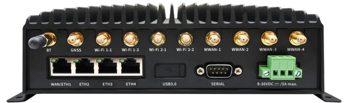
Digi TX54 dual Wi-Fi — back