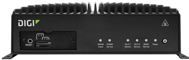
Digi TX54 dual Wi-Fi — front