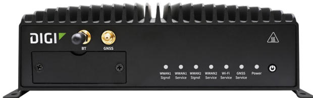
Digi TX54-2 dual cellular (PC 1.5) — front